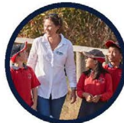
Build skills through fun